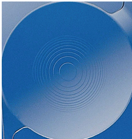
Fig. 1. The AcrySof ReSTOR with an apodized diffractive surface occupying the central 3.6 mm with precise reduction of diffractive step heights, from center to periphery where higher steps in the center, direct more light to near and lower steps in the periphery more direct light to distance.

The multifocal AcrySof Natural ReSTOR SN60D3 (Alcon) combines the function of both apodized diffractive and refractive regions [4] . The lens has a central 3.6-mm apodized optic region, where 12 concentric diffractive zones on the anterior surface have a gradual reduction in diffractive step heights from center to periphery (1.3 to 0.2 \mu\text{m} ), creating multifocality from near to distance (Fig. 1). The refractive